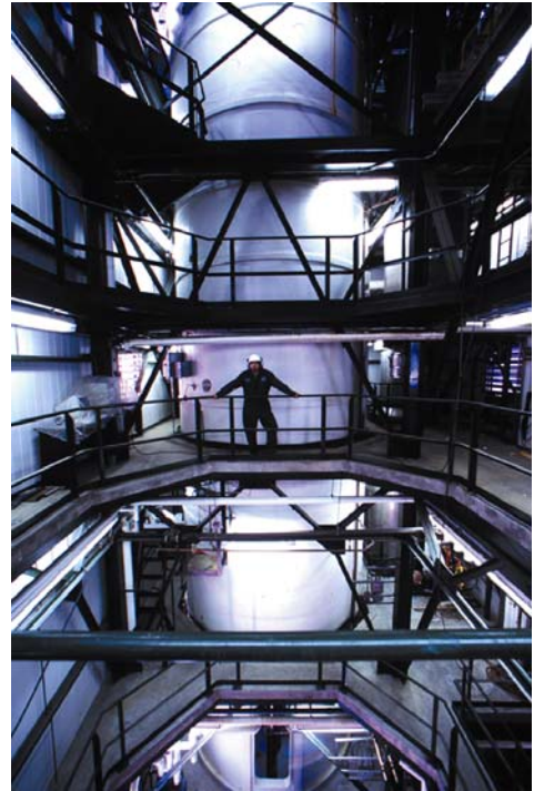
logen Corporation Fermentor

Future research is being directed to developing integrated bio-processes whereby two or more technologies are used at the same site. An example of this is distiller grains from ethanol production and glycerine