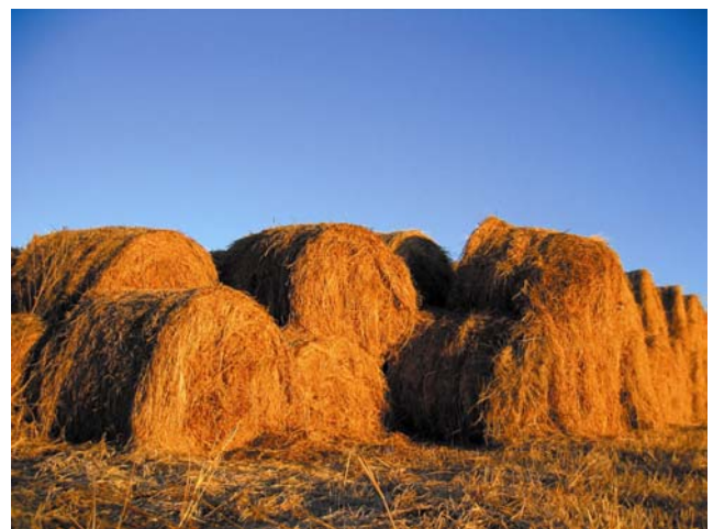
Haystack supply for Biomass

Canada is presently utilizing approximately 6% of its energy demand from the combustion of biomass. This amount of renewable bioenergy ranks second to hydropower in Canada's primary energy production. This is striking given the diverse existing and new biomass supplies available.